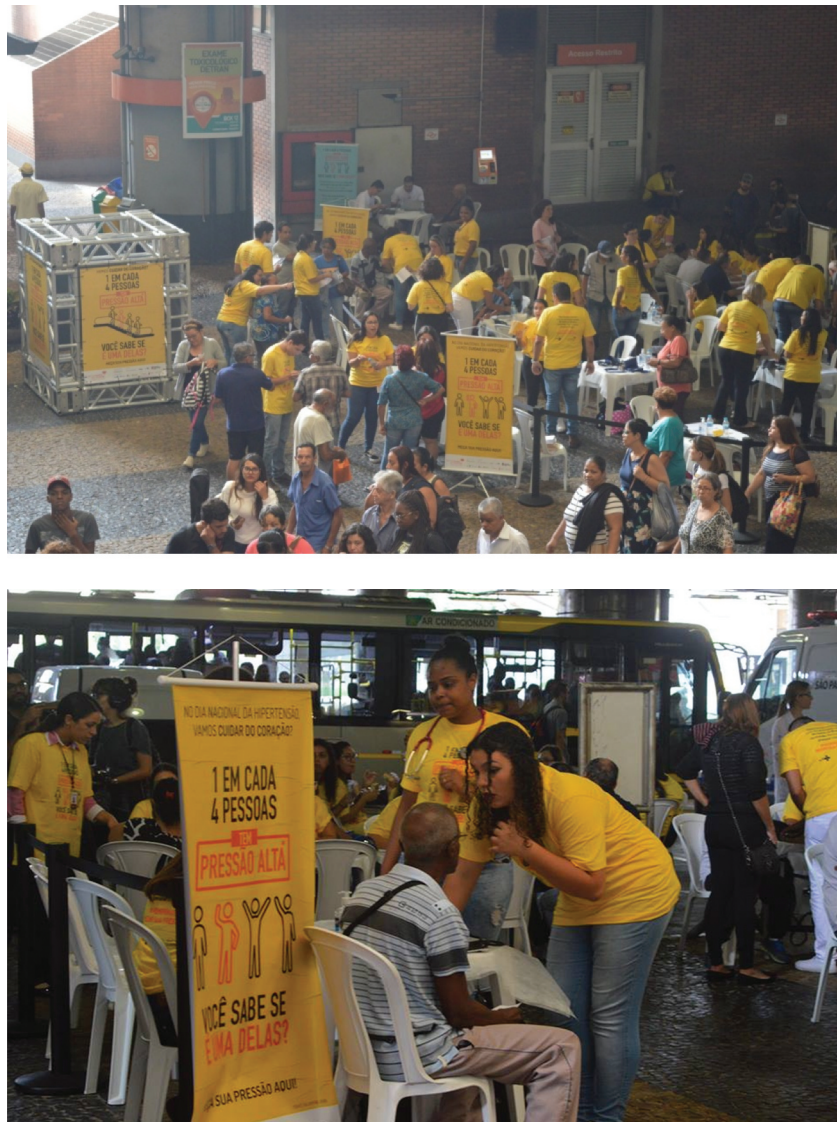
Figure 3. Community hypertension screening held at the Itaquera Metro Station, a major traffic intersection linking a shopping center, a sports stadium, public services, metro and bus station, with a capacity of 60,000 passengers per hour.

time information by one or two years, often provide the primary evidence base for decision-making pertaining to CVD. The Better Hearts Better Cities initiative introduced the systematic tracking of progress and data on hypertension diagnosis, treatment and control rates, for use in real-time (Novartis Foundation 2021, Boch et al. forthcoming). Data collected during the initiative are currently being used by the health authorities in Ulaanbaatar to further investigate the connection between health indicators, urban structures, and environmental and social components.