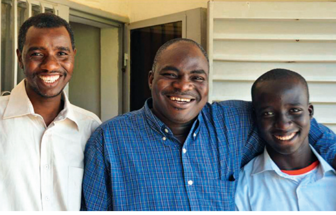
The team of the Novartis Foundation in Ségou